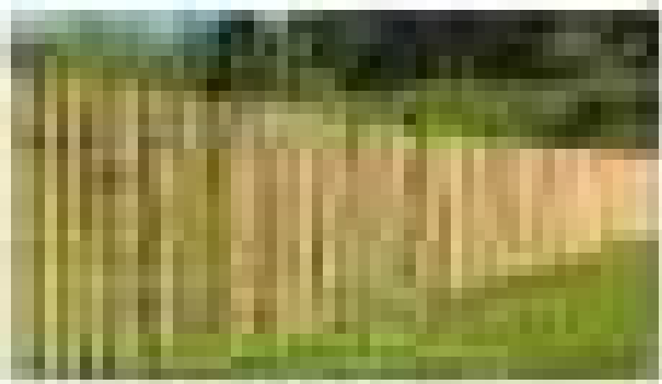
SECURITY FOR THE SITE (WOODEN SLAT FENCE) - 2008